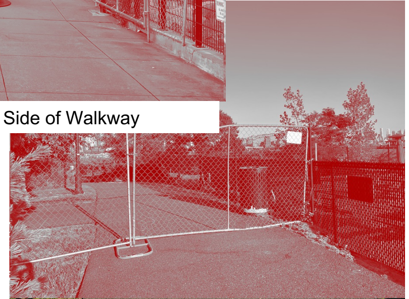
Closure of North Side of Walkway