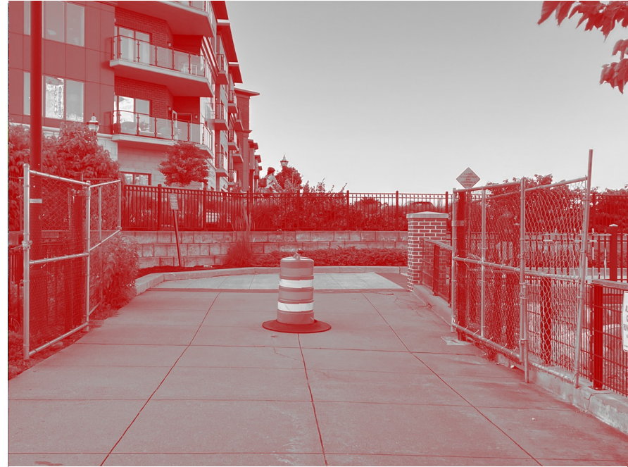
Closure of North Side of Walkway

Due to the closed walkway, Hudson County residents are being forced onto a narrow sidewalk along an extremely busy and dangerous sidewalk alongside Port Imperial Boulevard (River Road). When asked why the walkway is closed, the answers continue to be "construction". However, there was no construction occurring during the time the gates were installed nor any interference to the walkway today, given the proximity to current projects.